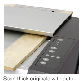
matic thickness control (ATAC)